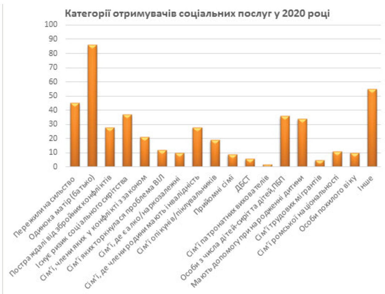
Fig. 4 Categories of recipients of social services Mykolaiv region during 2020