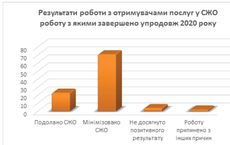
Fig. 6 Results of work with recipients in DLC work with which completed within 2020

Persons who were in difficult life circumstances and within 2020 completed the work at the Center for Social Services have achieved such results: «Minimized Szha» – 71 %, «overcome Szho» – 23 %, «not reached positive result» – 4 %, «work is discontinued for other reasons» – 2 % (Fig. 6).