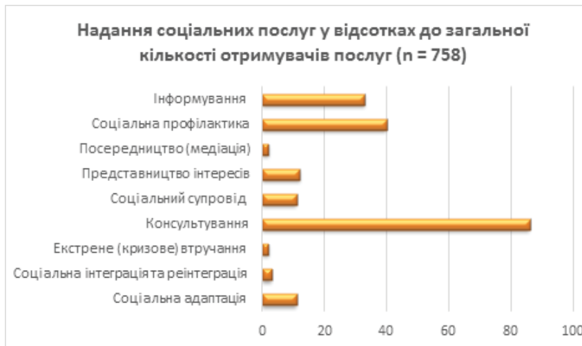
Fig. 3 Provision of social services in communities Mykolaiv region during 2020

From the given data it is possible to draw the following conclusions, in most cases received social services Category «Lonely Mother (Father)» – 86 %, the category «experienced violence» – 45 %, as well as social services recipients become individuals / families that can not be possible to attribute to any of the above categories («other») – 55 %.