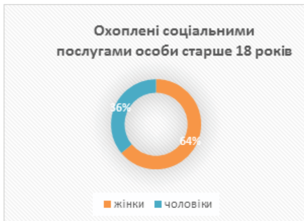
Fig. 1 covered by social services Persons over 18