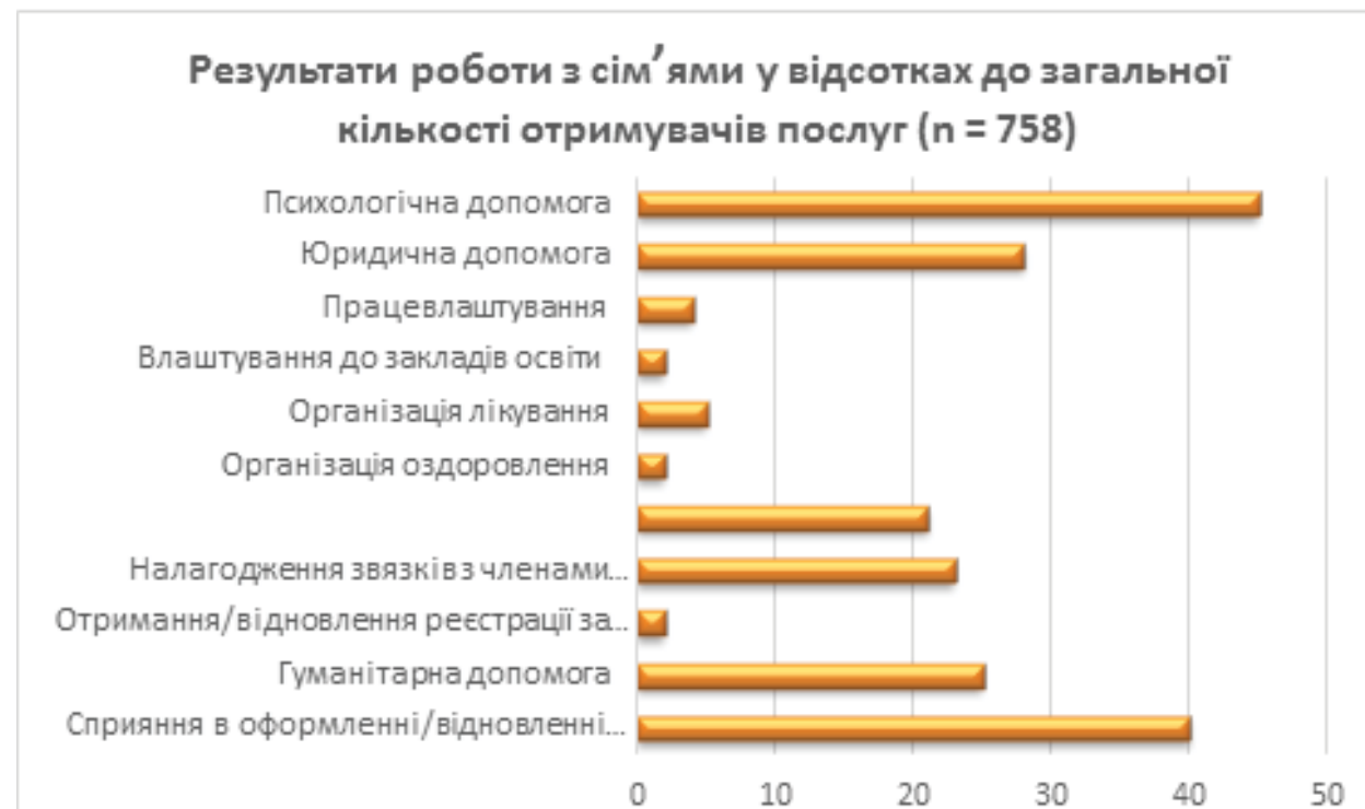
Fig. 5 Results of work with families Mykolaiv region during 2020